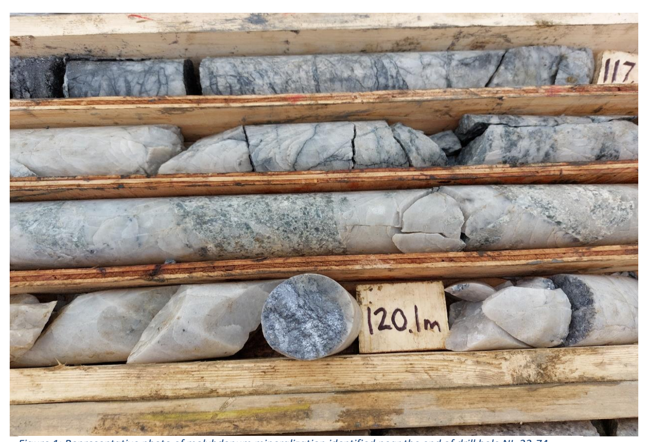
Figure 1: Representative photo of molybdenum mineralization identified near the end of drill hole NL-22-74

Alpha is undertaking a 5,000-metre drill program to test multiple high level geophysical targets The first 2022 drill hole, of this drilling campaign, IN-22-74 (Target 'J') started in volcanic mineralized rock then encountered felsic intrusive near the end of the hole (144 metres) where it intersected molybdenum mineralization (a classic characteristic of CRD mineralized rock in limestone is an adjacent molybdenum mineralized porphyry body). Please find attached photo of molybdenum mineralization in hole IN-22-74.